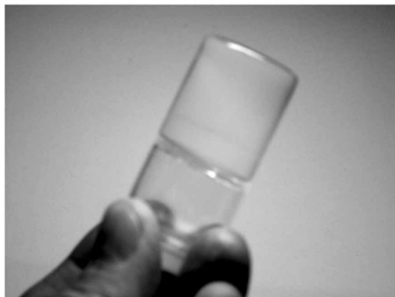
Figure 1. A picture of nearly transparent polymeric physical gels of CD-complexed poly( t -BMA).

IR (Diamond): \nu = 2933 (CH stretching), 1715 (C=O stretching), 1444 (CH aliphatic), 1370 ((CH 3 ) 3 ), additional bands at: 1147, 1085 cm -1 .